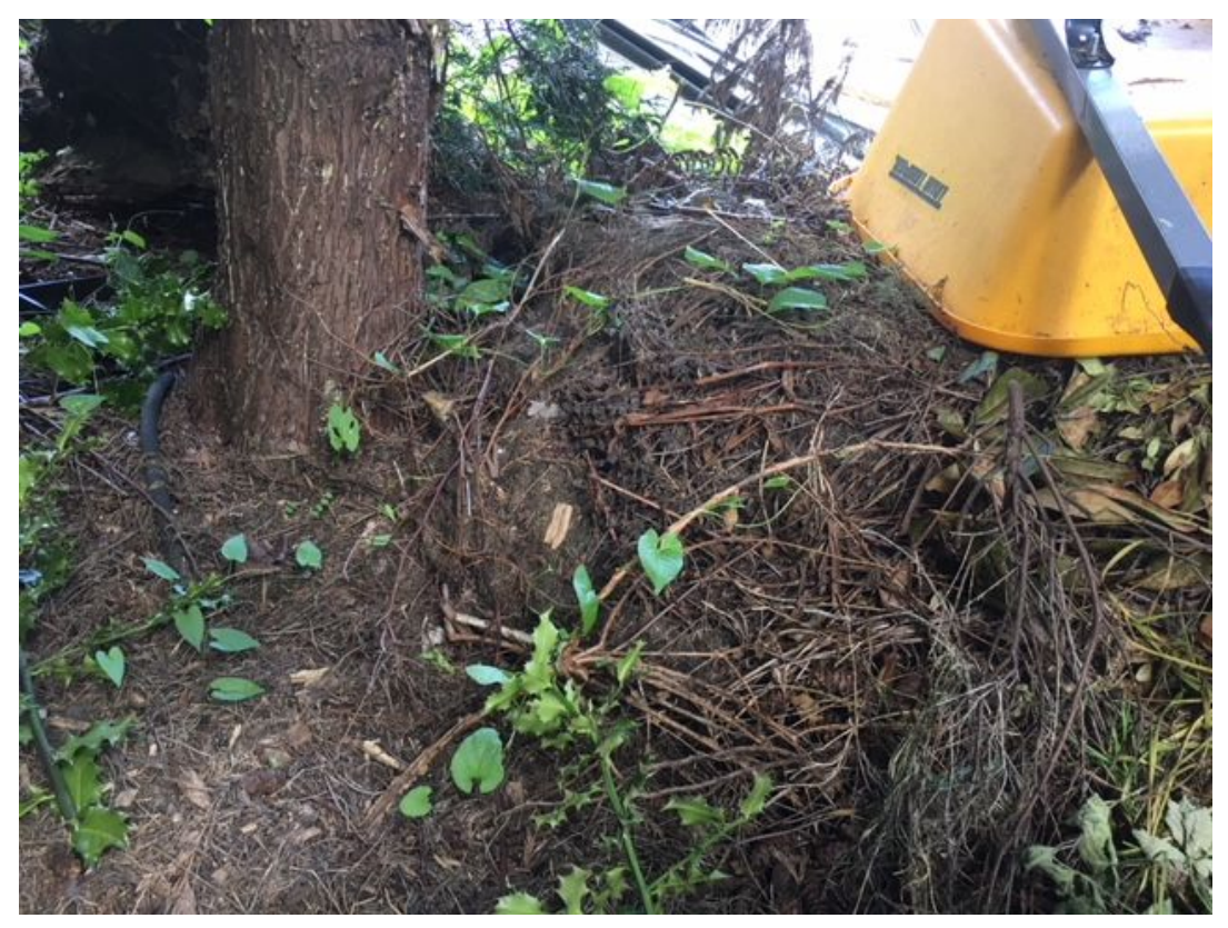
Photo of tree #2, Western Red Cedar, with fill material placed over root zone.