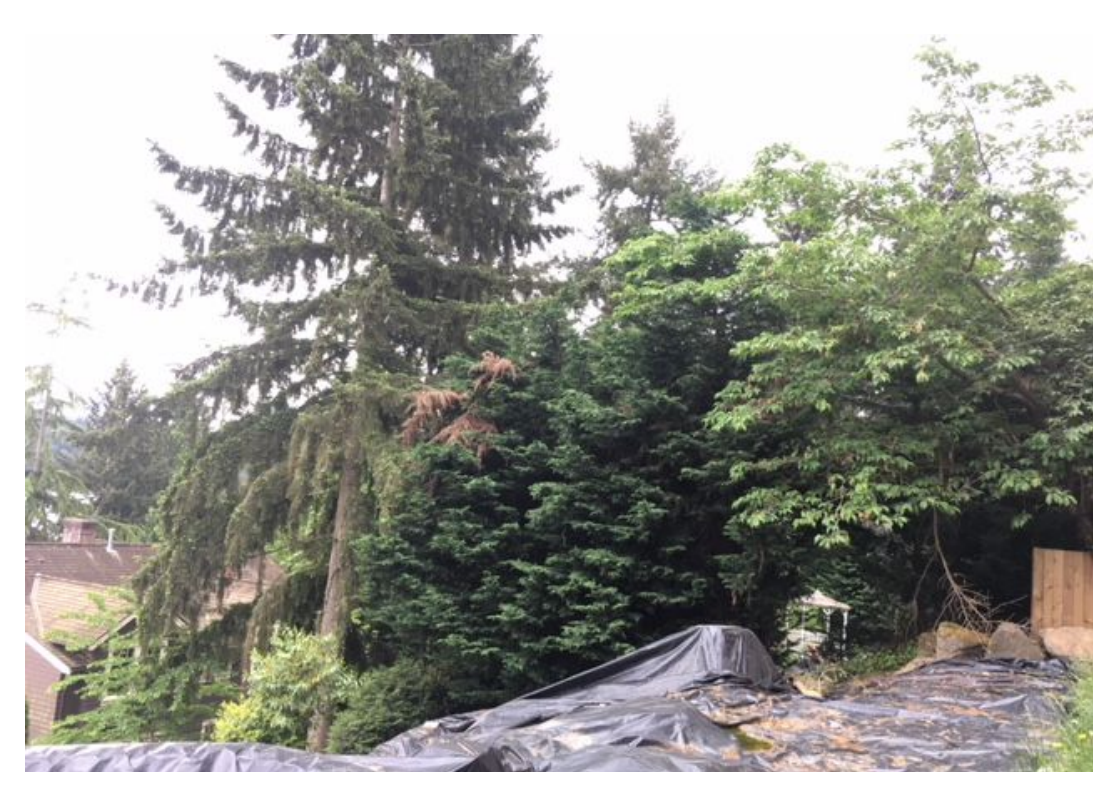
Photo taken on north side of backyard looking south toward small and large trees along edge of property