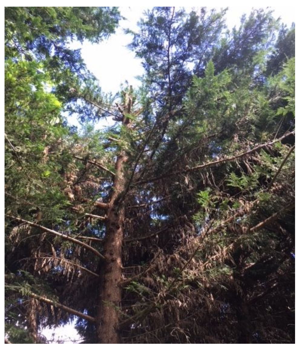
Photo of crown damage and topping central leader of Western Red Cedar

Please feel free to contact me if you have any questions concerning this report.